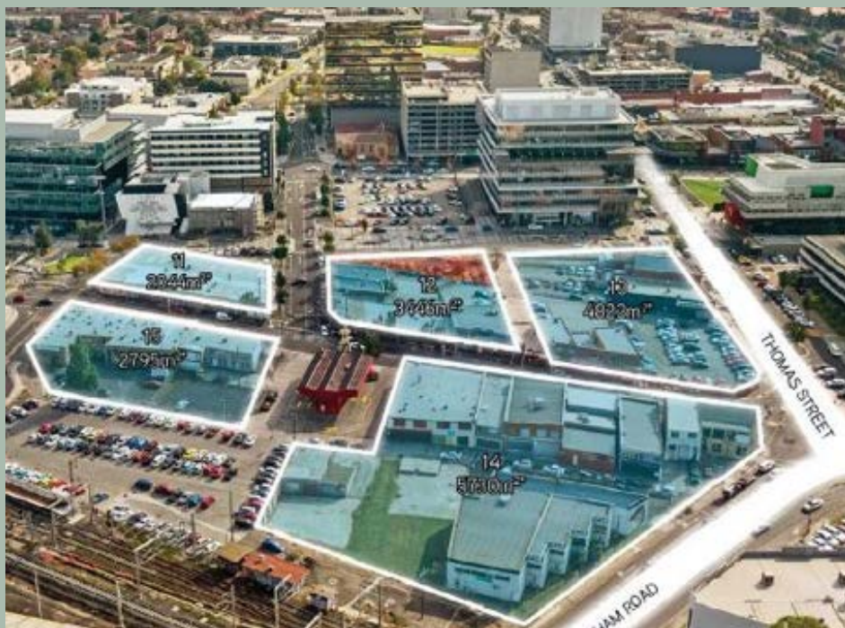
Figure 1 An aerial photo indicating the project sites 11 to 15

The cultural precinct will be delivered within the first stage of the master plan. Construction is expected to commence in 2023 – subject to town planning approval.